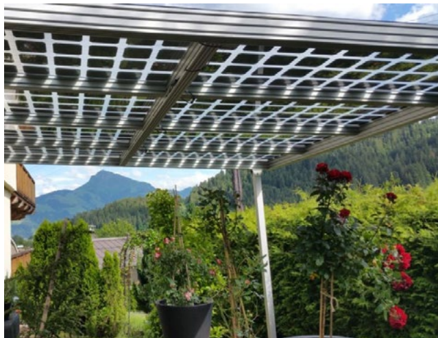
Picture: Terrace MILA 4